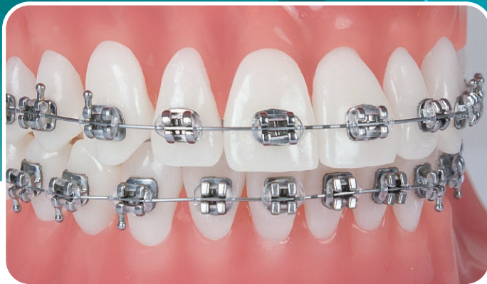
Pinnacle Single Patient Kit for chairside presentation