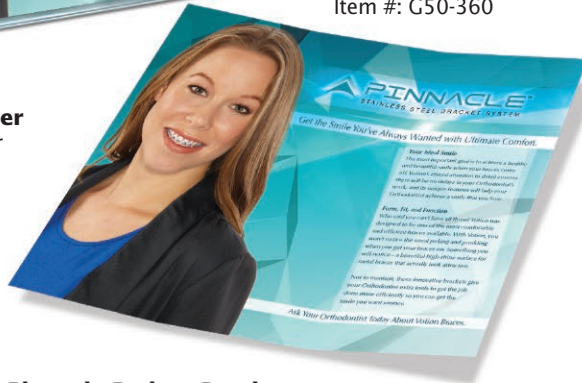
Pinnacle Patient Brochures 1 refill pack of 25 full color trifold brochures Item #: B-00744