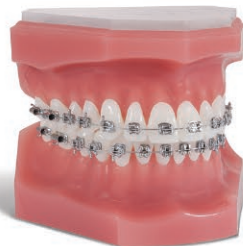
Pinnacle Ideal Occlusion Typodont Item #: G50-360