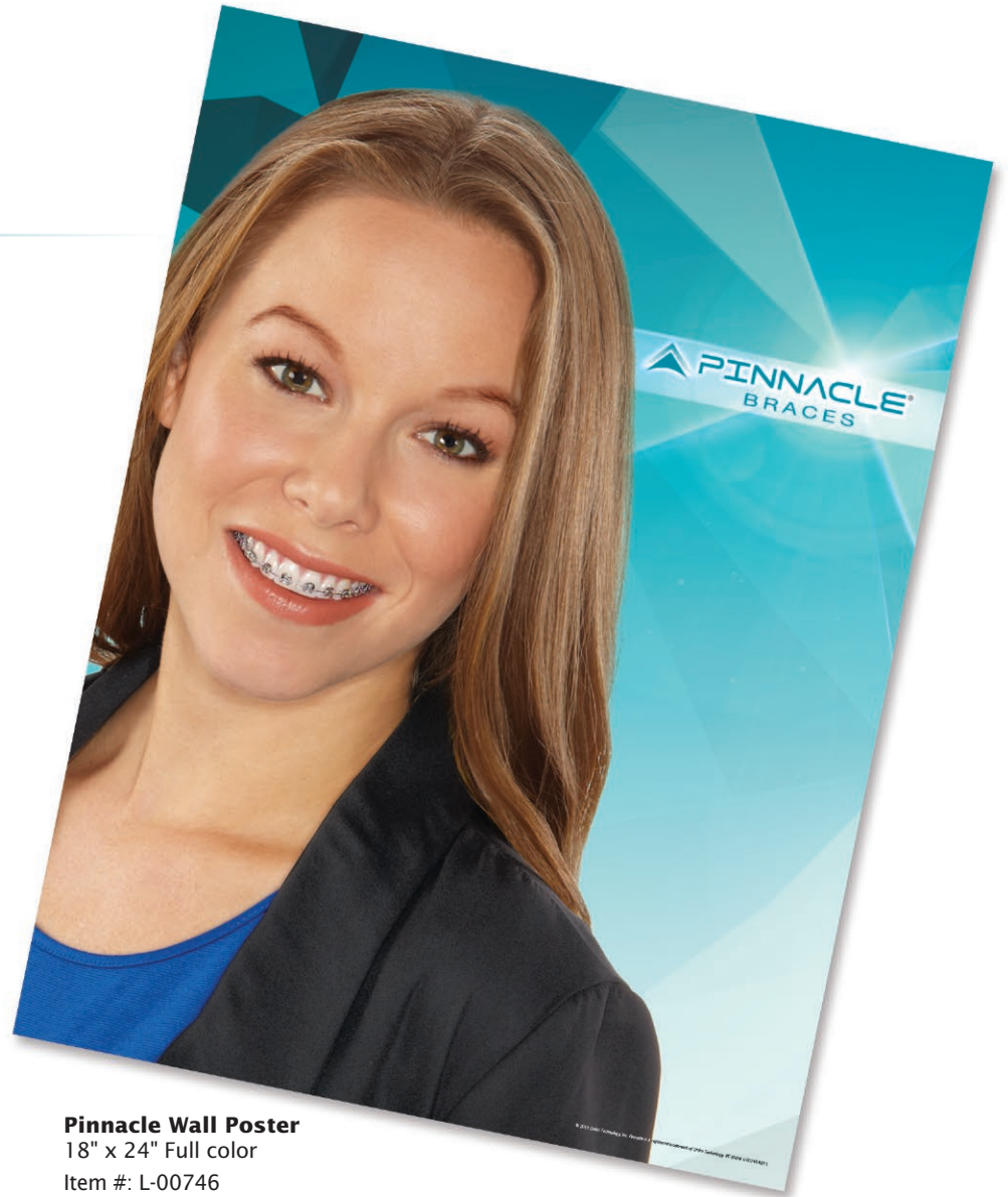
Pinnacle Wall Poster 18" x 24" Full color Item #: L-00746