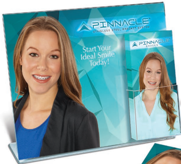
Pinnacle Patient Consultation Center Includes 25 full color trifold brochures Item #: S700 (Stand design may vary)

Helping You Generate Enhanced Patient Interest!